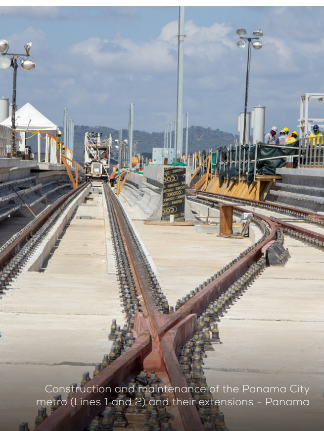
Construction and maintenance of the Panama City metro (Lines 1 and 2) and their extensions - Panama