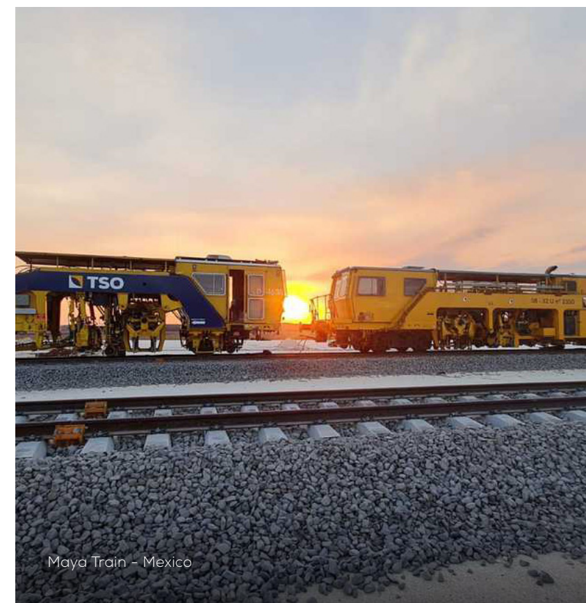
Maya Train - Mexico