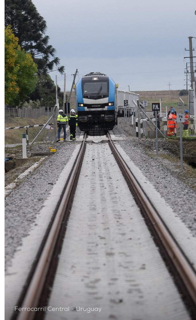
Ferrocarril Central - Uruguay