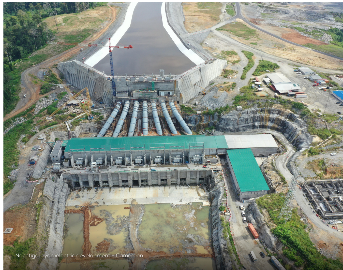
Nachtigal hydroelectric development - Cameroon