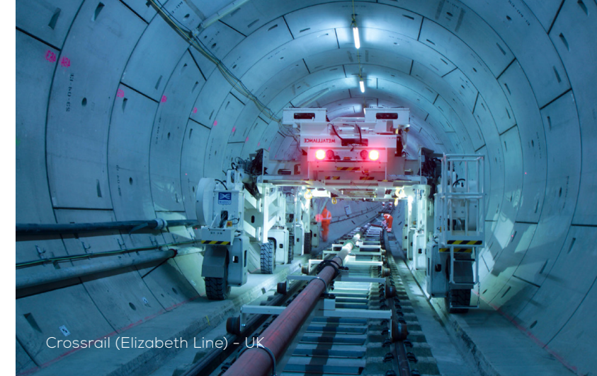
Crossrail (Elizabeth Line) - UK