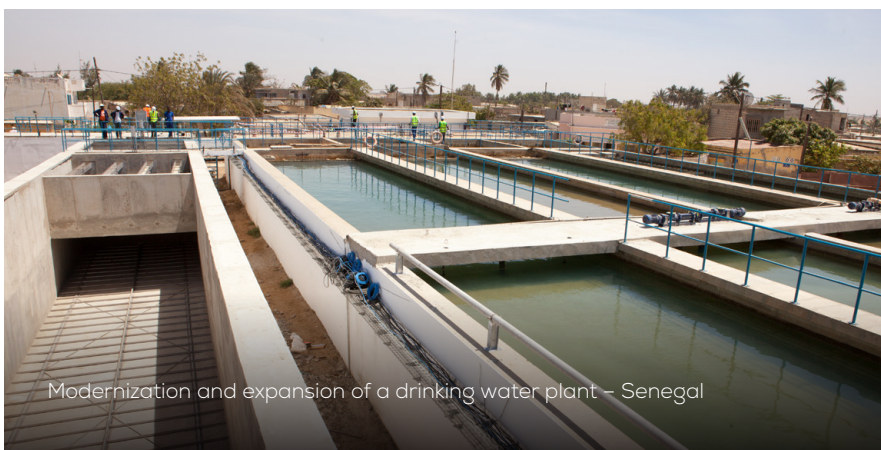
Modernization and expansion of a drinking water plant - Senegal