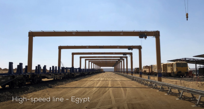
High-speed line - Egypt