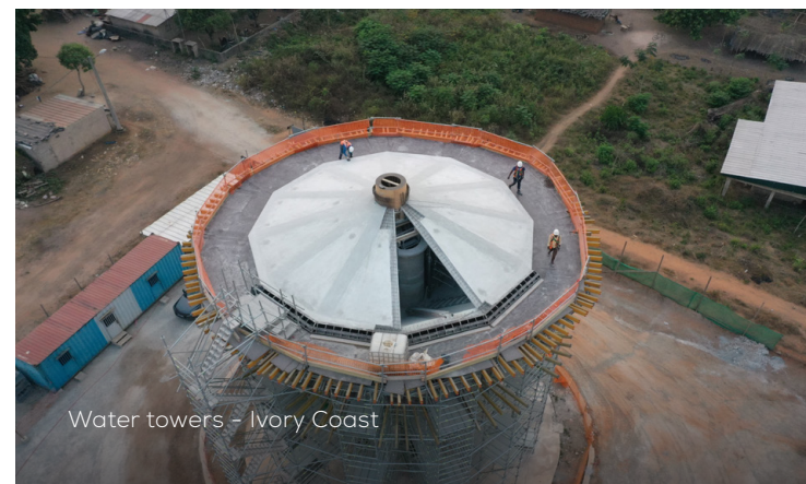
Water towers - Ivory Coast

NGE is able to act as a true industrial and financial integrator by providing funding for public-private partnerships spanning concessions, public service outsourcing and partnership contracts.