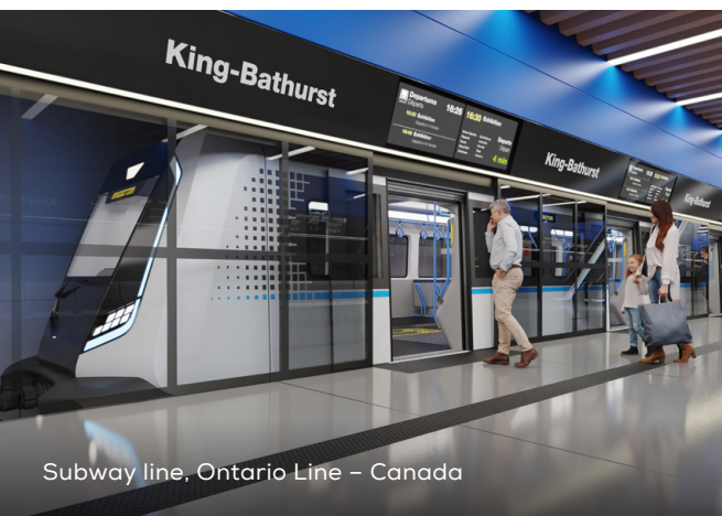
Subway line, Ontario Line - Canada