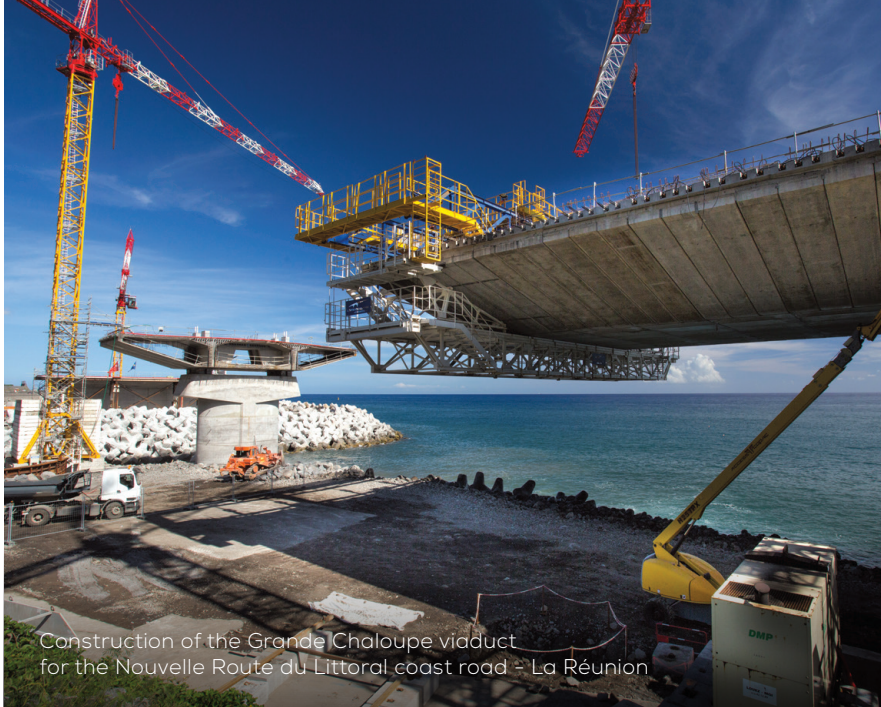
Construction of the Grande Chaloupe viaduct for the Nouvelle Route du Littoral coast road - La Réunion