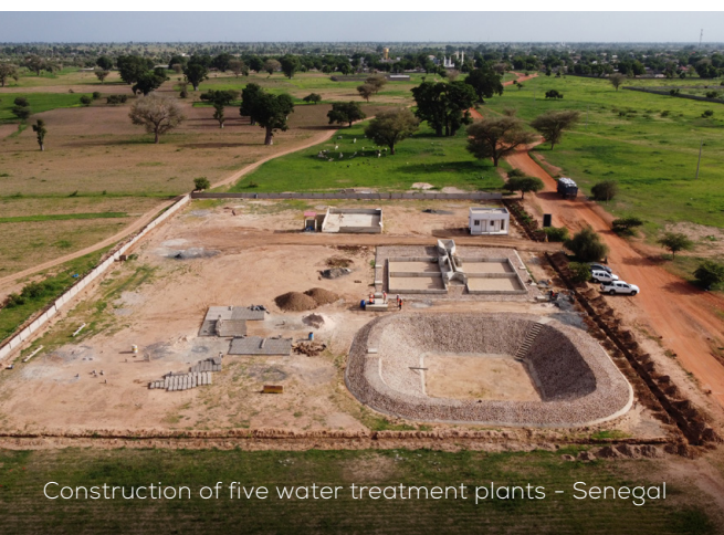
Construction of five water treatment plants - Senegal