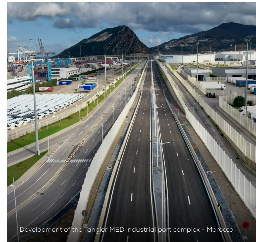
Development of the Tanger MED industrial port complex - Morocco