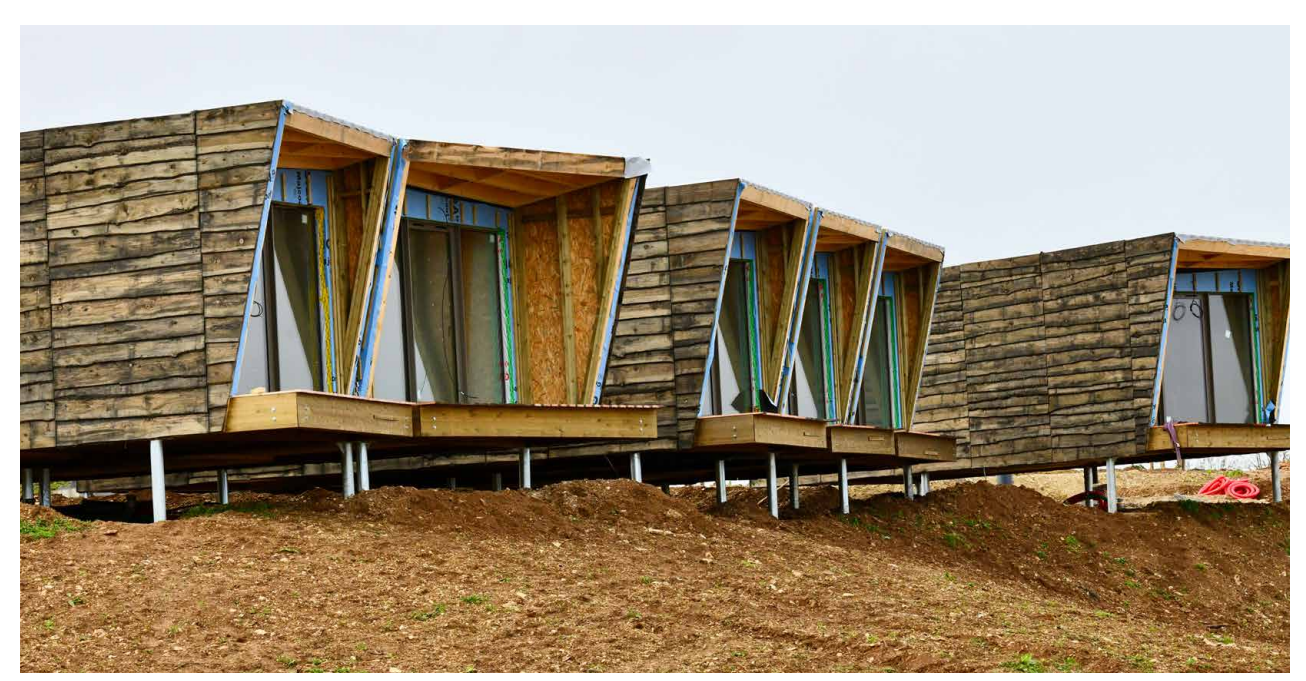
Creation of an EcoLodgee hotel complex with 120 wooden lodges in Poitiers (86)

The other movements presented in the statement of changes correspond to the change in fair value of the "Financial assets, Concessions and PPP" category.