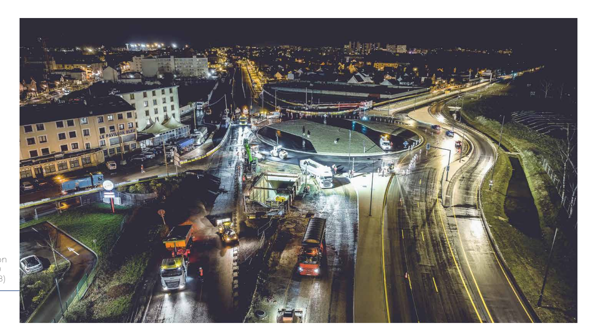
from the RN10 to Trappes (78