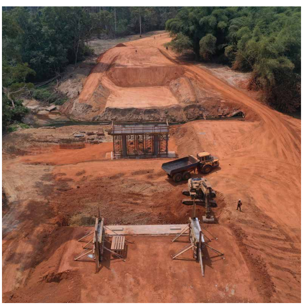
Construction of 7 bridges in Ivory Coast

Current provisions correspond to provisions directly linked to the normal operating cycle for the portion due in less than one year.