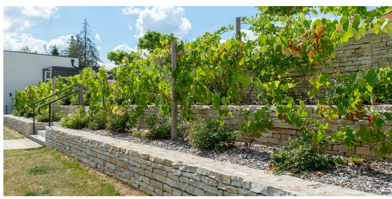
Landscaping in Thionville (57)