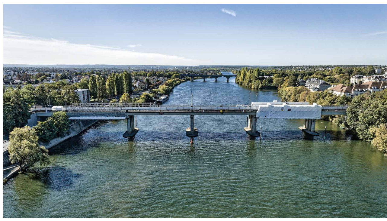
Renovation of the Maisons-Laffitte bridge (78)