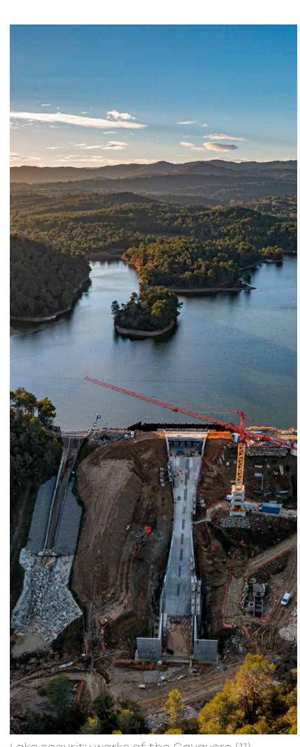
Lake security works of the Cavayere (11)