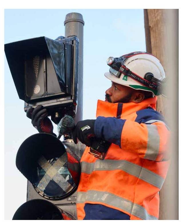
Installation of tricolor signaling in Bordeaux (33)

In the event that the forecast at the end of the project shows a loss, a provision is recognised independently of the progress of the project, based on the best estimate of the projected net income including, where applicable,