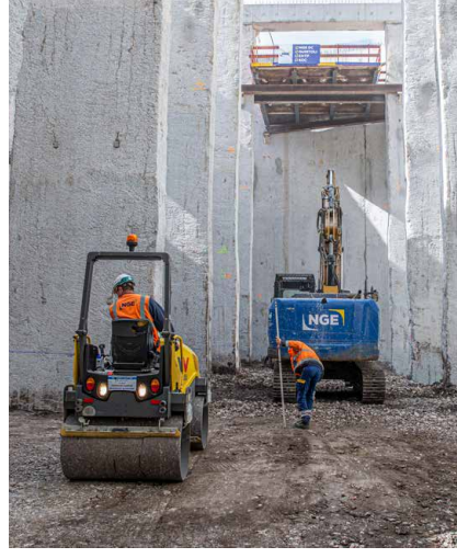
Rainwater treatment station in Champigny-sur-Marne (94)