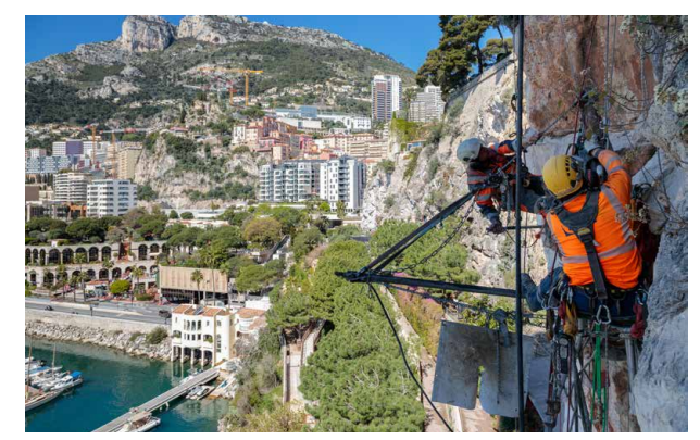
Securing cliffs in Monaco

Impairment losses resulting from impairment tests on equity-accounted investments are recognised through net income and deducted from the carrying amount of the corresponding investments.