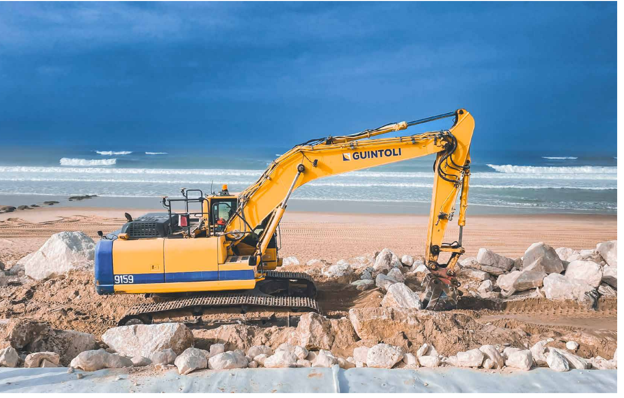
Raising dikes in Lacanau (3

As at 12/31/2022 no share of other items of comprehensive income for associates and joint ventures is recognised according to the equity method.