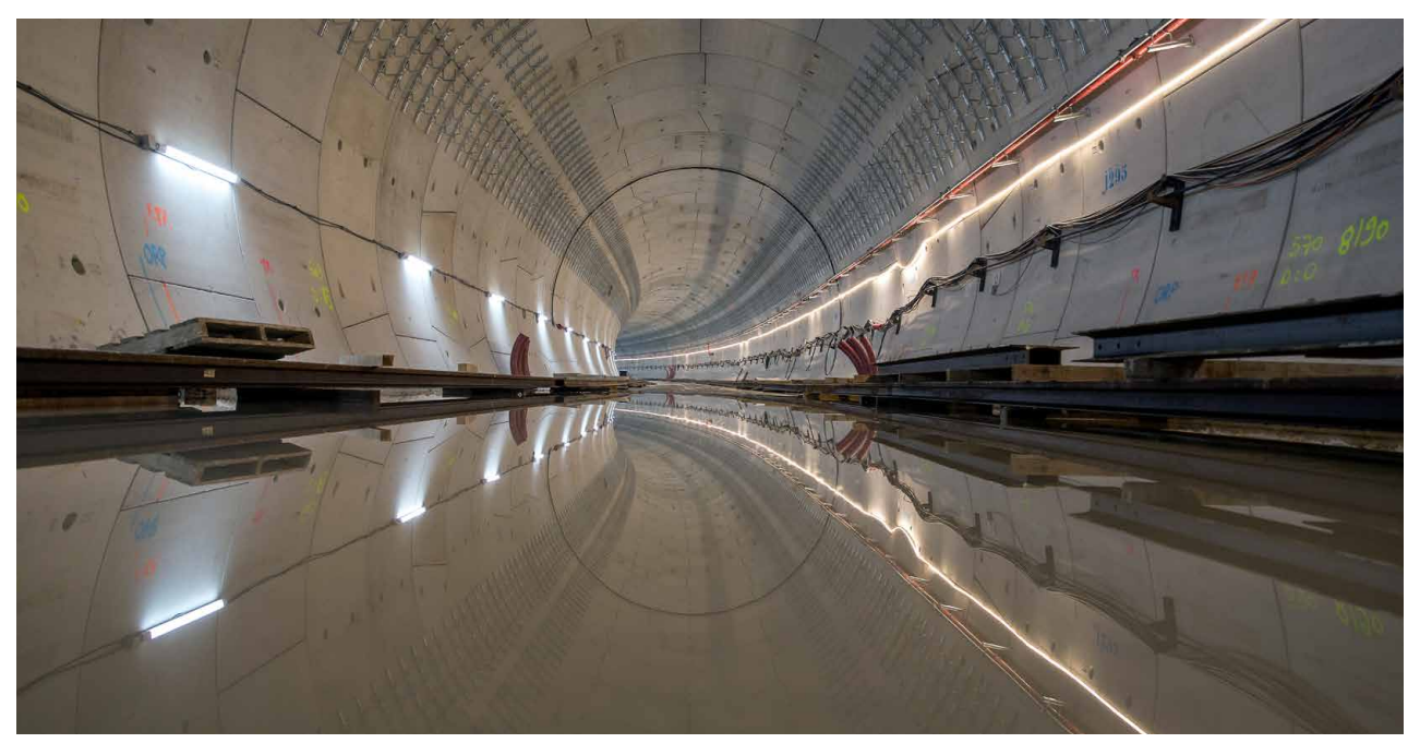
Line 11 of the Grand Paris Express